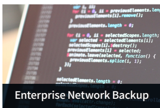
Enterprise Network Backup