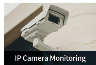
IP Camera Monitoring